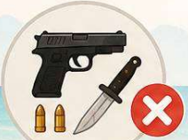
Weapons & Ammunition