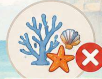
Protected Wildlife & Marine Life