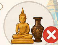
Antiques & Buddha Images (without permit)